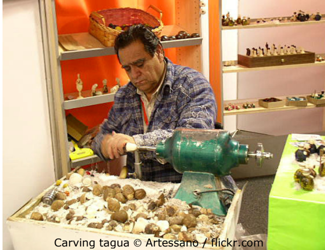
Carving tagua