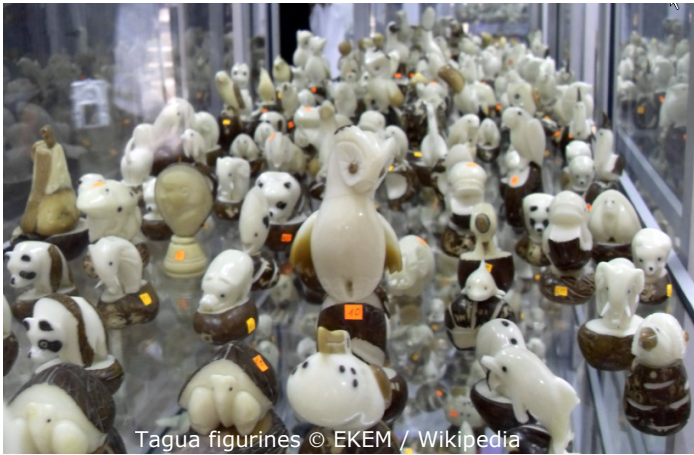
Tagua figurines