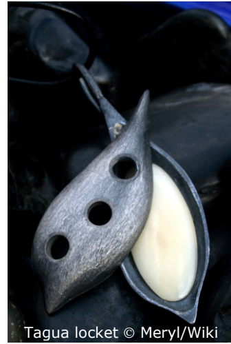
Tagua locket