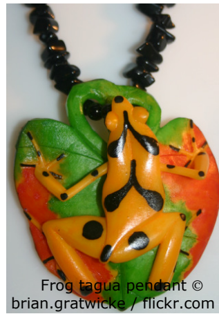
Frog tagua pendant